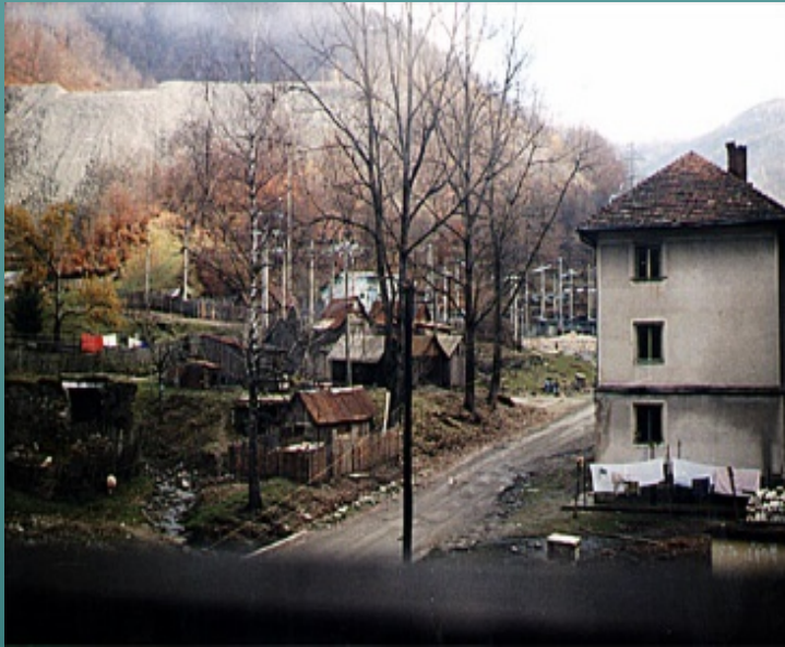
Block houses in Baita Plai, extremely close to the waste deposits.