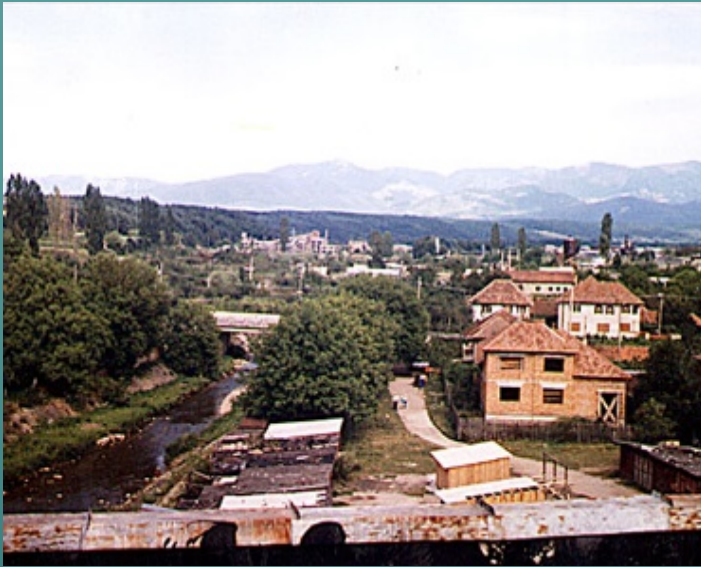
The „Moara 4” – radioactive rocks „mill”, in the immediate proximity of the Stei town; from here, the concentrates go to Feldioara