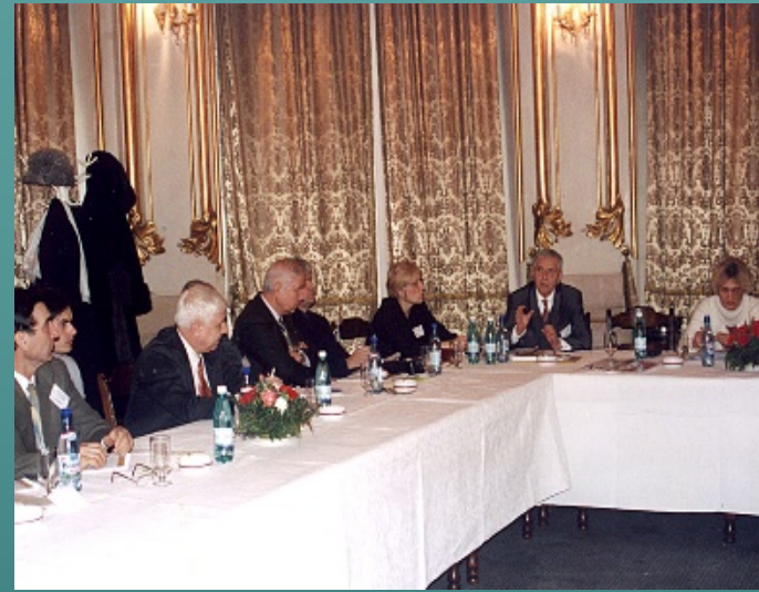
Seminar in the project NucleAarhus („nuclear staff“)