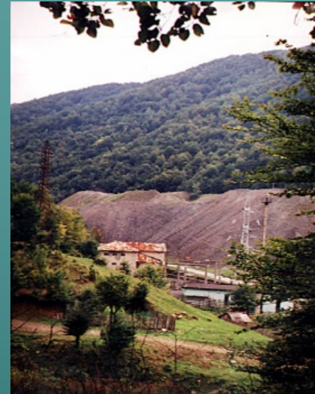
The former „Club” of the miners, in the „Zero Area”; it was, also, used as Rescue and Healthy Unit (Baita Plai)