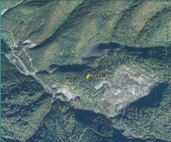
Aerial picture of the Baita Plai area