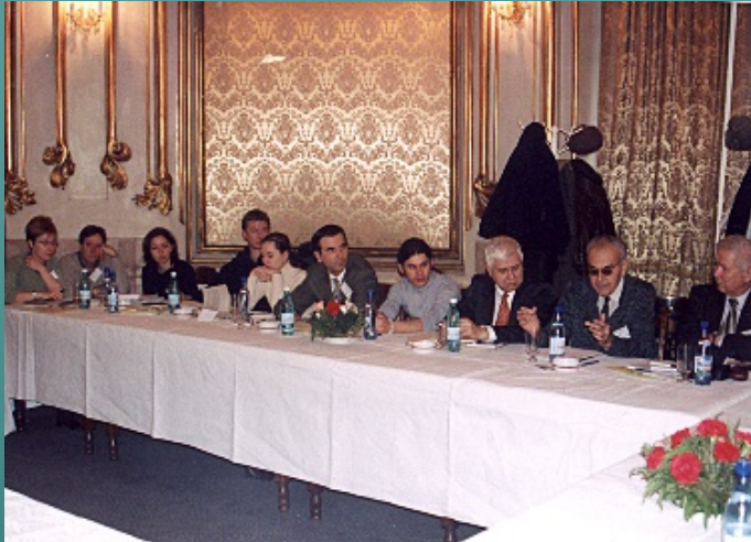
Seminar in the project NucleAarhus (NGOs and experts).