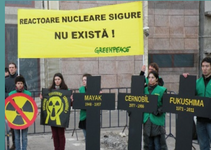
Greenpeace demonstration against nuclear energy, in the front of Environment Ministry