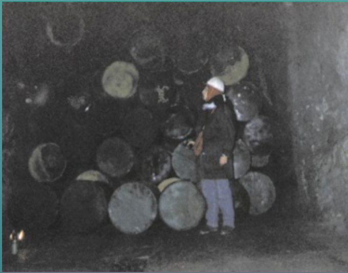
The deposit of radioactive wastes Baita)