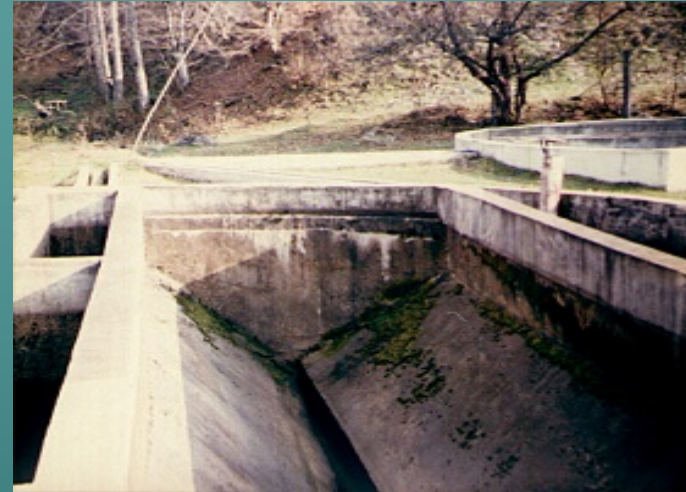
The sewage unit for wasted water from the mine and social group; at least in the 10 last years of the mine, it was left in deterring