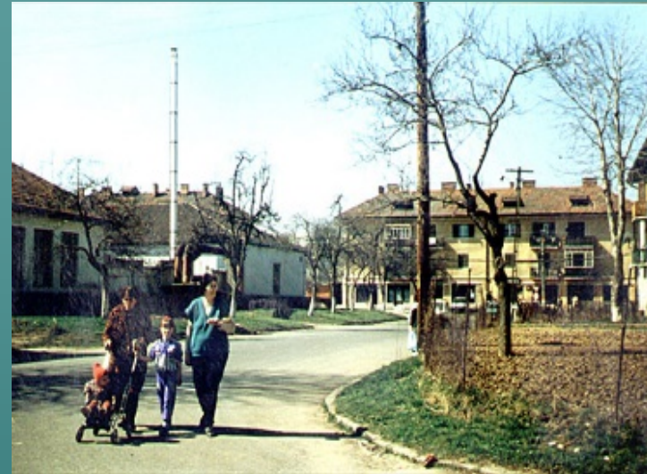
The Laboratory for Uranium minerals analysis (left side), in the middle of the Stei town